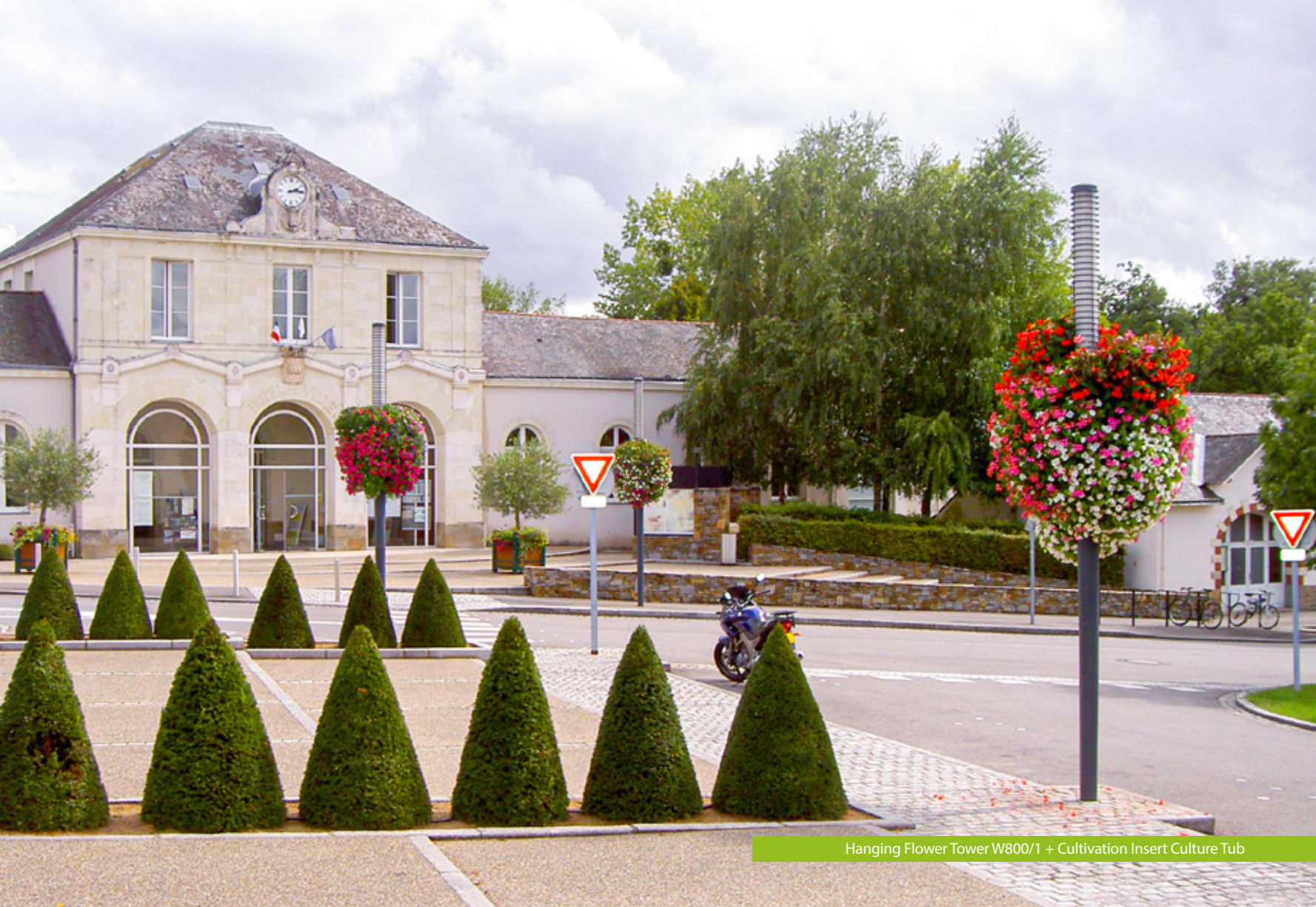
Hanging Flower Tower W800/1 + Cultivation Insert Culture Tub