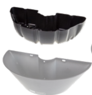
Culture Tub for W600 Flower Towers